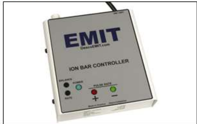
Figure 4. EMIT 50940 Controller with Recessed Potentiometer Adjustment